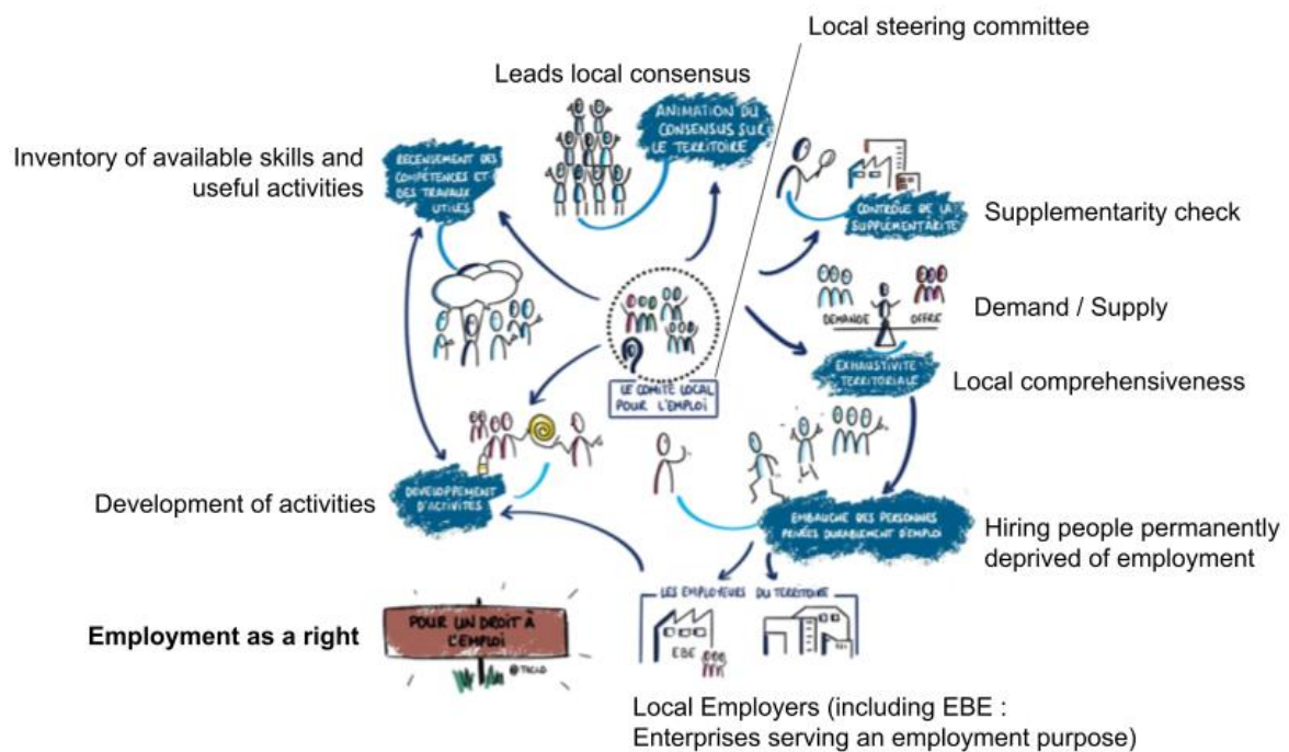
Figure 2. Diagram of the organisation of the Territoires Zéro Chômeur de Longue Durée trial scheme.

supports the authorised regions, in particular by financing a portion of the remuneration of the people hired in the recognised companies, and evaluates the experimentation. The Board of Directors of the Experimentation Fund is comprised of representatives of the State, of the employee and employer trade unions, regional authority associations, members of parliament, territories and other public bodies involved in the trial scheme. The figure below presents the organisation of the TZCLD trial scheme.