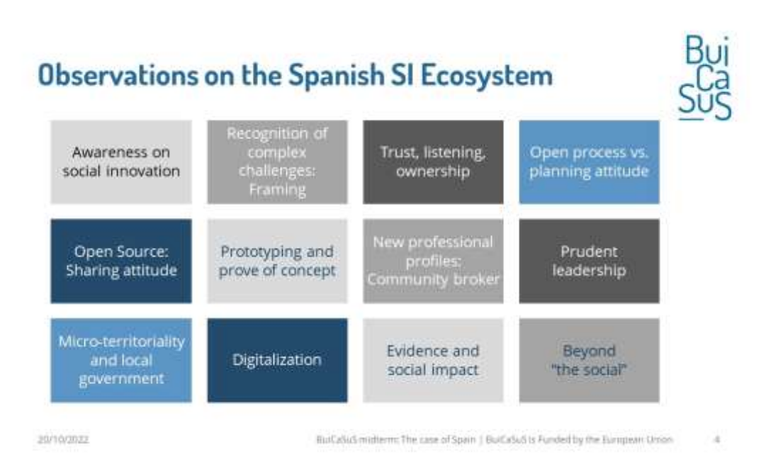
Figure 7. Key findings country mapping: SPAIN