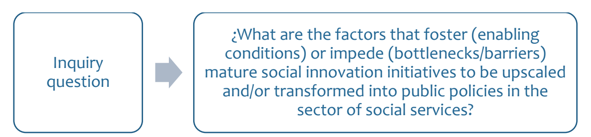
Figure 3: General inquiry question

Likewise, an outreach strategy to include SI actors to make the screening as participatory as possible has been devised by the national research coordinators in different manners, as best fitted to the respective country environment.